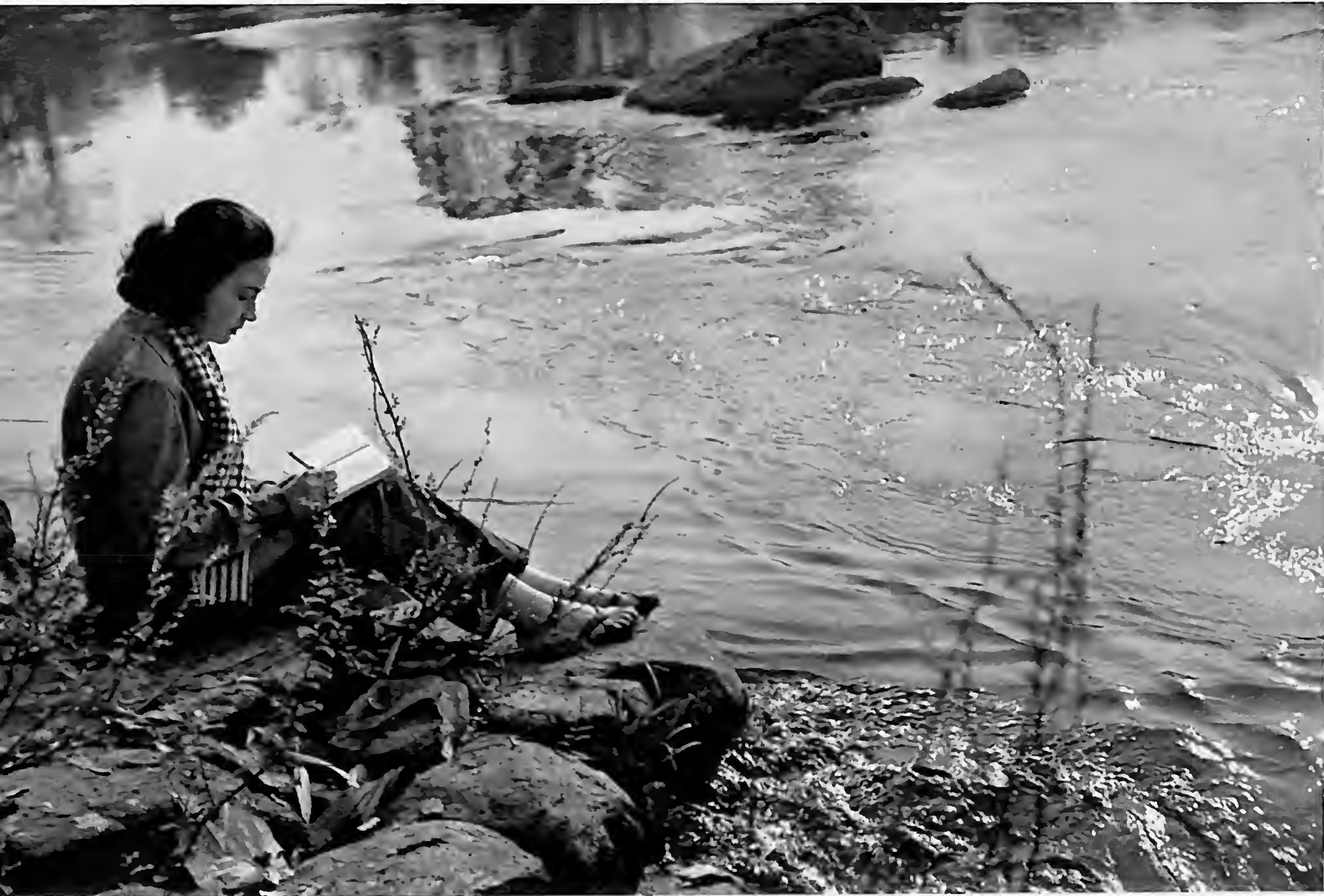
Madame Sihanouk persists in keeping a diary during the journey.